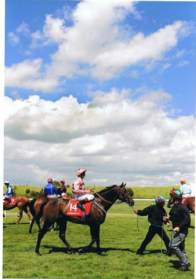
Frankie Dettori on Mine in his 4 th Bunbury cup, having already won it 3 times