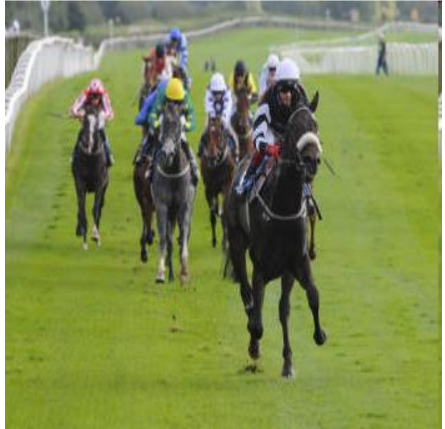
Hartley winning by 8 Lengths on his 2 nd outing.

Hartley was bought for 17,000 guineas and then sold to Hong Kong for £350,000 after being beaten a short head by a Group 1 winner.