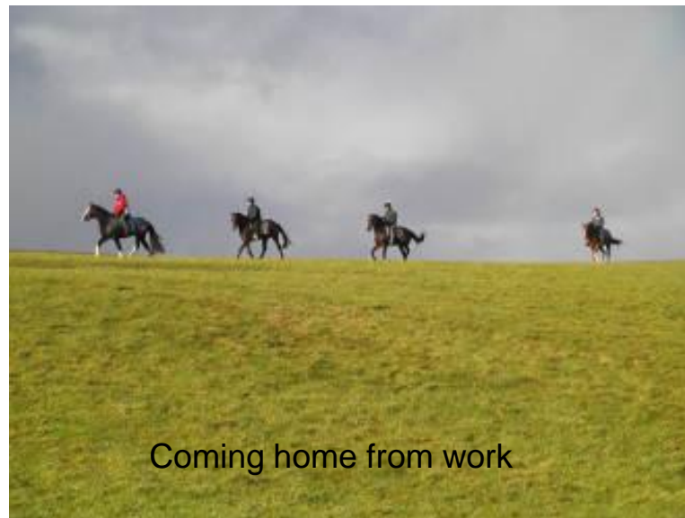
Coming home from work