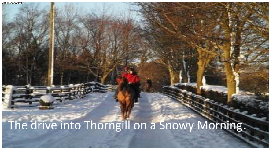
The drive into Thorngill on a Snowy Morning.