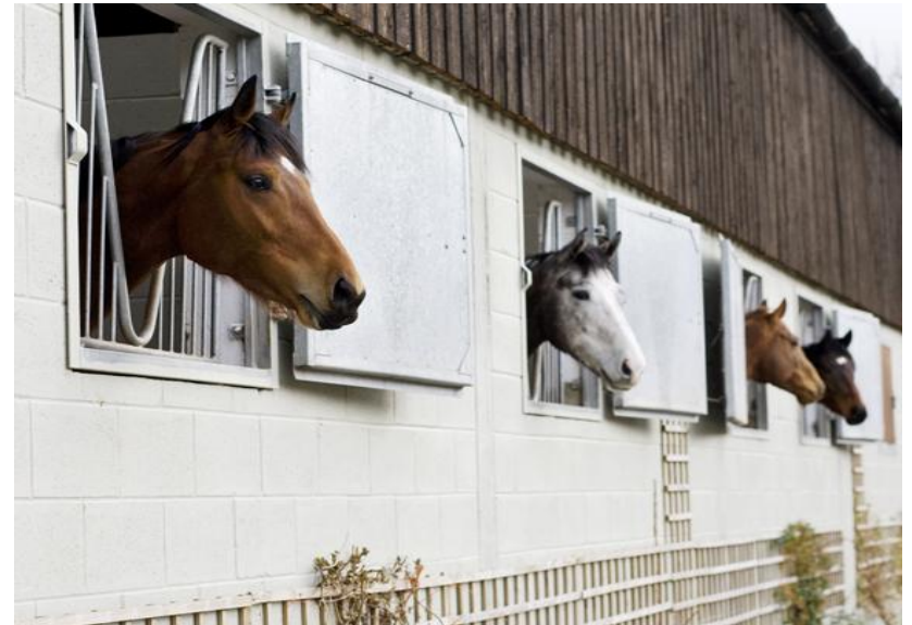
A view from my window