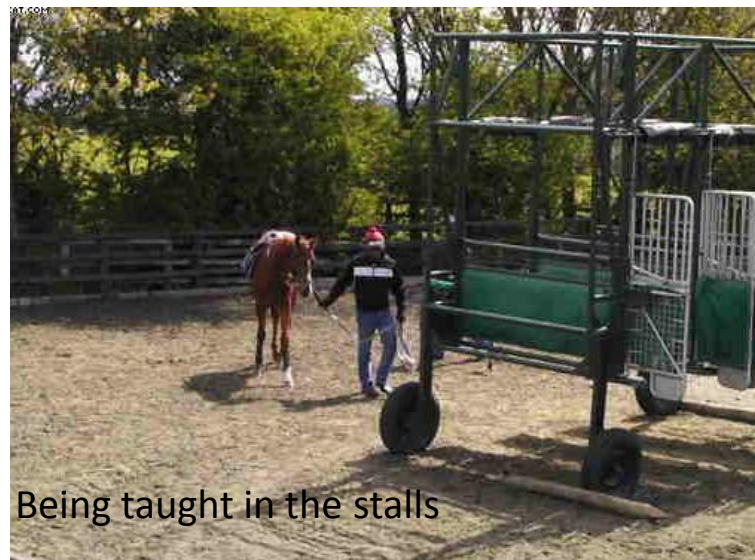
Being taught in the stalls