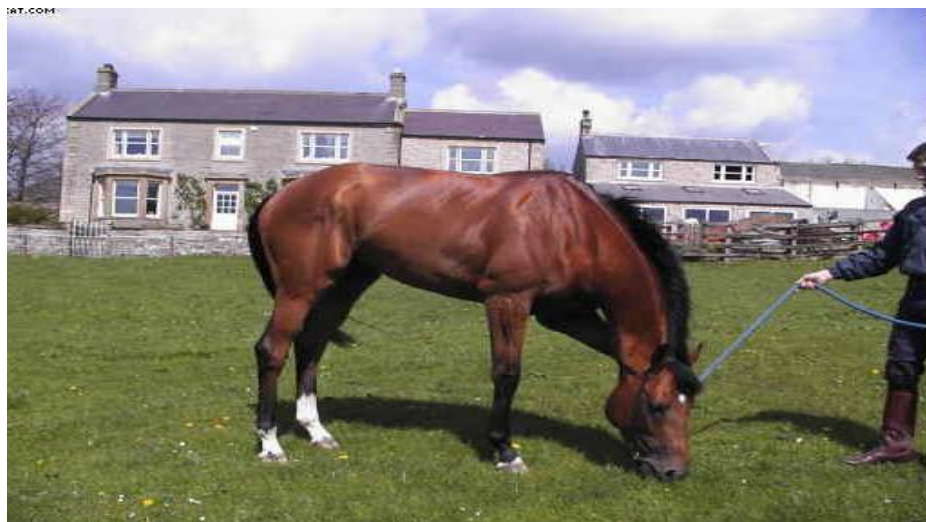
Enjoying a pick of grass in front of the house after winning